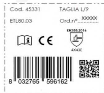
Reference standard :